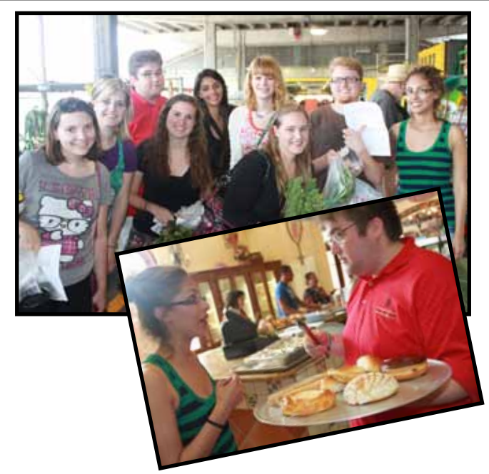
Students in the Spanish Honors Program practice their skills on a trip to a local farmers' market.

The Spanish Honors Program provides an alternative for Honors College students interested in pursuing a course of study in Spanish Language. This Program offers the opportunity to learn the language in an optimal environment, following an accelerated curriculum. Students are able to complete the equivalent of two semesters of Intermediate Spanish in one semester of intensive instruction (SPAN 2605H).