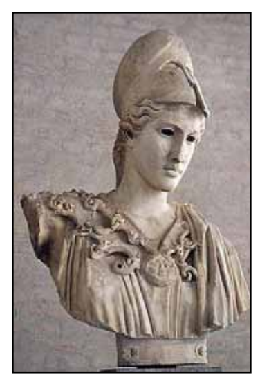
P hronesis is the Greek word for prudence, or practical wisdom. Aristotle identified it as the distinctive characteristic of political leaders and citizens in adjudicating the ethical and political issues that affect their individual good and the common good.

An Interdisciplinary Program in Politics and Ethics Minor Housed in The Honors College