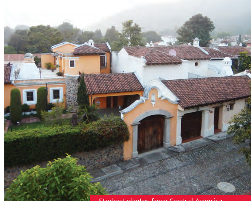
Student photos from Central America