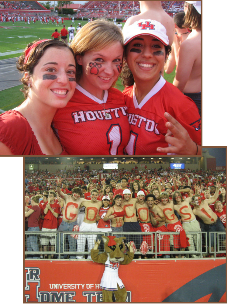
Honors College students enjoying the college tailgates and the football games, demonstrating their Cougar pride.