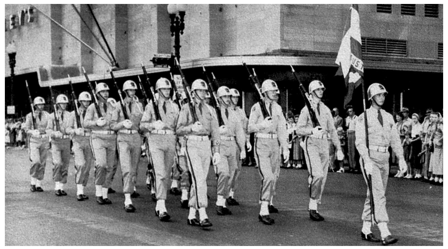
Shown here in downtown Houston in 1952, the Cullen Rifles marched in various parades during their existence, including the Armistice and Veterans Day parades and at the New Orleans Mardi Gras parade.

that in the early- to mid-1950s, physical training was not a mandatory morning activity in a cadet's life, as one might assume of a military unit, because the cadets were expected to stay in shape on their own. Instead, the cadets and the Rifles began their mornings like any other student—going to classes with freedom in between to do as they pleased. By virtue of being a part of the Rifles, though, they had an activity added to their agenda. "Every morning at seven o'clock," the Rifles met to rehearse their drills and maneuvers for upcoming events. These rehearsals proved essential to refining rifle handling skills into an art form.